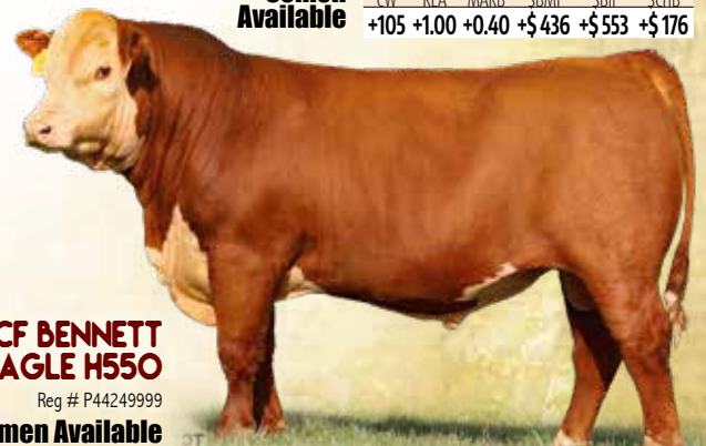
KCF BENNETT EAGLE H550