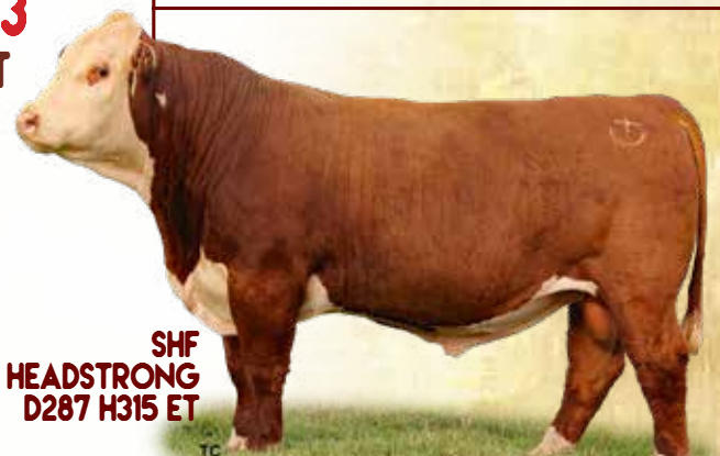
SHF HEADSTRONG D287 H315 ET