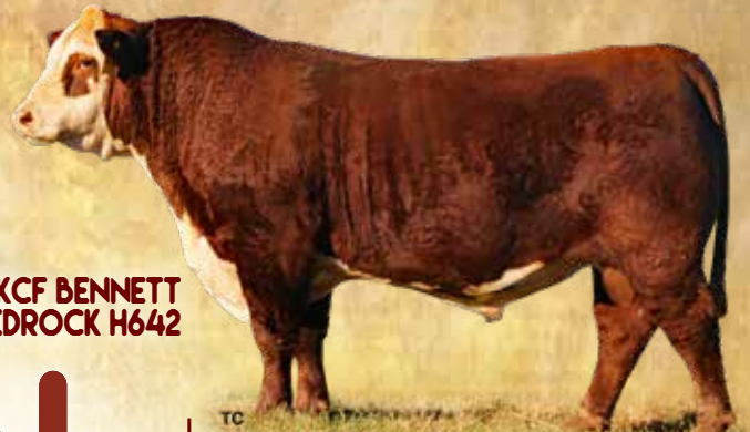
KCF BENNETT BEDROCK H642