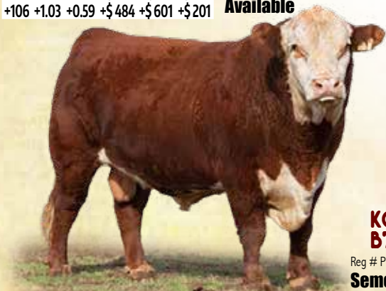
KCF BENNETT B716 F597