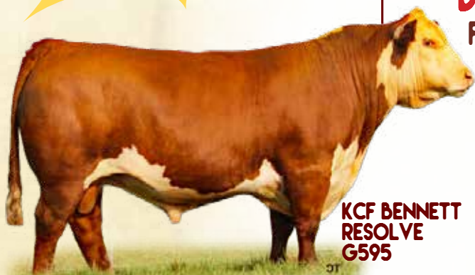
KCF BENNETT RESOLVE G595

ANGUS, HEREFORD, GELBIEH AND BALANCER BULLS