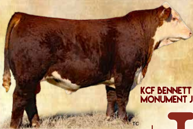
KCF BENNETT MONUMENT J338