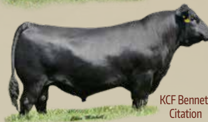
KCF Bennett Citation