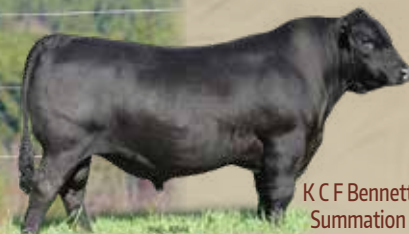
KCF Bennett Summation