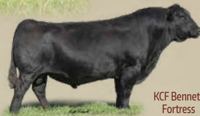
KCF Bennett Fortress

These three are the total of heifer calves due this Fall from the mating of Thomas Patricia 9705 to KCF Bennett Consent Y75. Full siblings to these heifers include KCF Bennett Summation (Katie-Colin Farms and Quaker Hill Farms), KCF Bennett Assent (Alta Genetics) and KCF Bennett Citation (44 Farms). Maternal siblings to these heifers include KCF Bennett Fortress (Select Sires), KCF Bennett Immense (Semex) and KCF Bennett Optimizer (Connealy Angus).