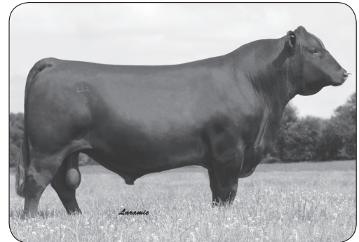
GAR Sure Fire Sire of lot 95B.