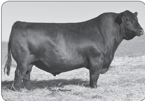
Basin Payweight 1682 Sire of lot 95A

★ D512 is a bonafied herd bull prospect. In the flesh, he's stylish, sound, powerful and big hiped. His total data profile is flawless and his sensational Pathfinder dam is one of the top 5 cows at KCF. Z521 is feminine, sound, stout and perfect uddered. Currently, she records 3@111 WWR, 3@114 YWR, 3@114 IMF, 3@111 RE. Lot 95B: IMF 5.42/133, RE 14.1/102. Top 25% CED, 4% WW, 4% YW, 4% SC, 25% DOC, 3% HP, 10% Milk, 15% CW, 10% Marb, 5% RE, 2% $W, 10% $F, 5% $G, 10% $QG, 10% $B.